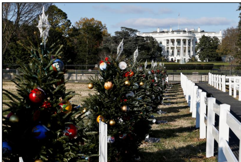
56 trees surround the National Christmas Tree in President's Park each year. The trees are decorated with ornaments created by students in each state, territory and the District of Columbia.