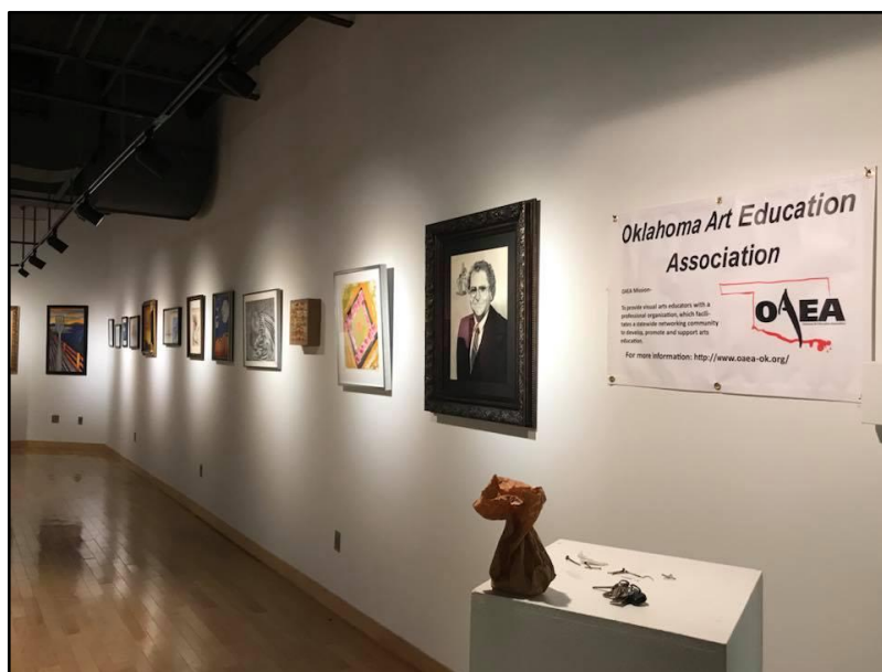
The OAEA Member Show was installed on September 15th at the Garvey Center, and it may be viewed through October 13th.