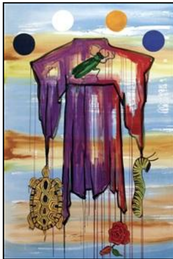
Carousel, by Jaune-Quick-to-See Smith

Where - Oral Roberts University 7777 S Lewis Ave, Tulsa, OK 74171 (see maps on pages 7, 8, 9) When - Friday, Sept. 30, 2016 and Saturday Oct. 1, 2016