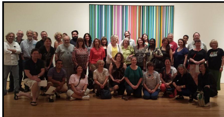
OKCPS Art Teachers receiving Professional Development on the Core Art Standards, June 5, 2014-at the OKCMOA

If you did not attend the event as audience, you will need to fill in the brief registration form. If you attended as an audience member, use the password you received when you logged in to the meeting. This link will remain active for one year until June 4th 2015