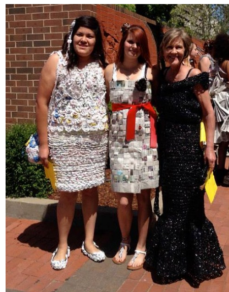
Turpin High School entries. Absolutely brilliant!